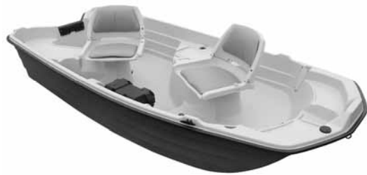
Bass Hound™ 10.2