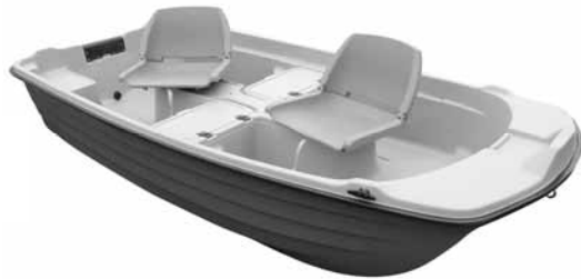
Bass Hound™ 9.4

KL Industries, Inc. 1790 Sun Dolphin Dr. Muskegon, MI 49444 Phone 231-733-2725 Fax 231-739-4502 Email klsales@klindustries.com Website www.klindustries.com